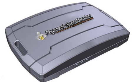
Small 3" X 2" X 1" Device Rugged Polycarbonate Case Heat & Cold Resistant (-40* to +185* f)