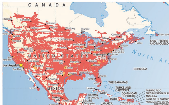
The Largest Coverage Area In North America